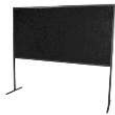
Poster Board 4'x6' 4'x 6' or 4' x 8' Horizontal & Vertical