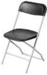
Folding Chair Black, Grey