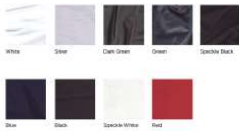
Table Skirting Colours