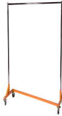
Garment Rack- 5ft Single