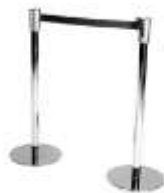
Retractable Stanchion 2 Stanchions & 1 Tape