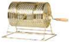
Draw Drum Small & Medium