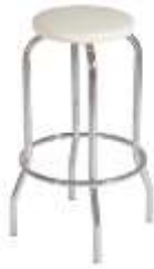
Bar Stool – Backless Black, White