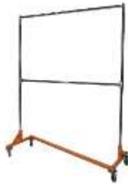
Garment Rack 5ft Double