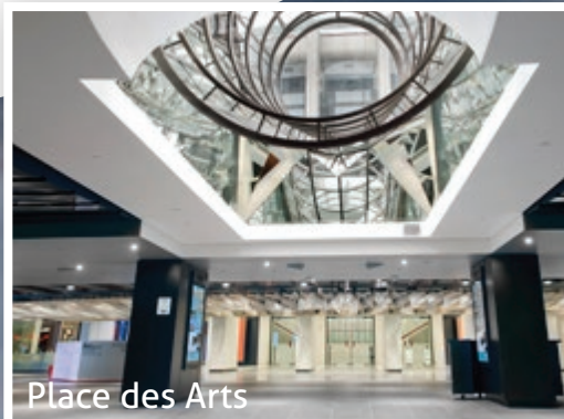
Place des Arts